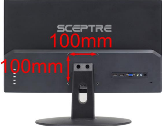
- 11 www.SCEPTRE.com SCEPTRE E24 Display User Manual

2. The display's mountain pattern is 100mm by 100mm using M4 x 10mm size screws.